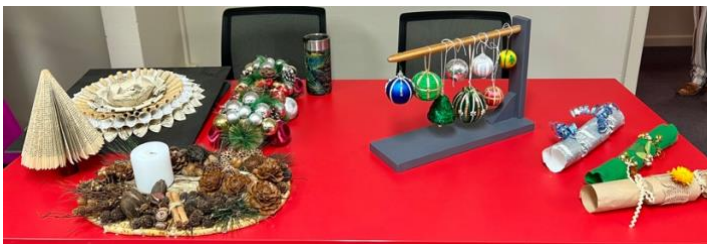
Simple Paper Folding and Christmas Decorations