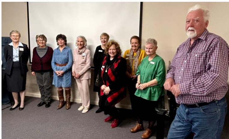
Your 2023-24 Committee